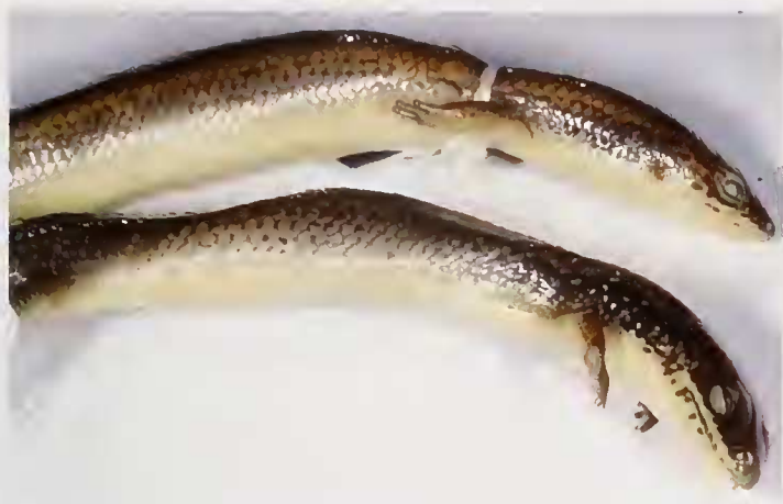
Fig. 14. Mochlus guineensis , from Cotonou (above) and Lama Forest (Noyeau central) (below).

invariably to escape upwards. They were mainly active between 11.00h and 15.00h, at air temperatures of 31–32°C.